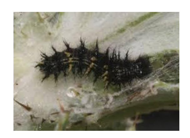
Until one day