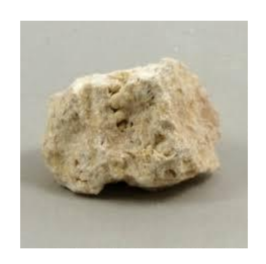
Does it have needs?